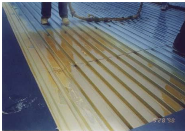
FIGURE 3: SPF ADHESIVE FULL COVERAGE