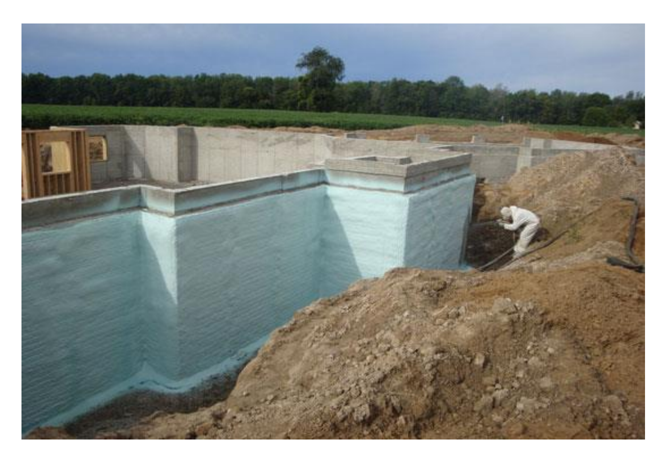
Figure 3 – Exterior below-grade wall installation (photo)