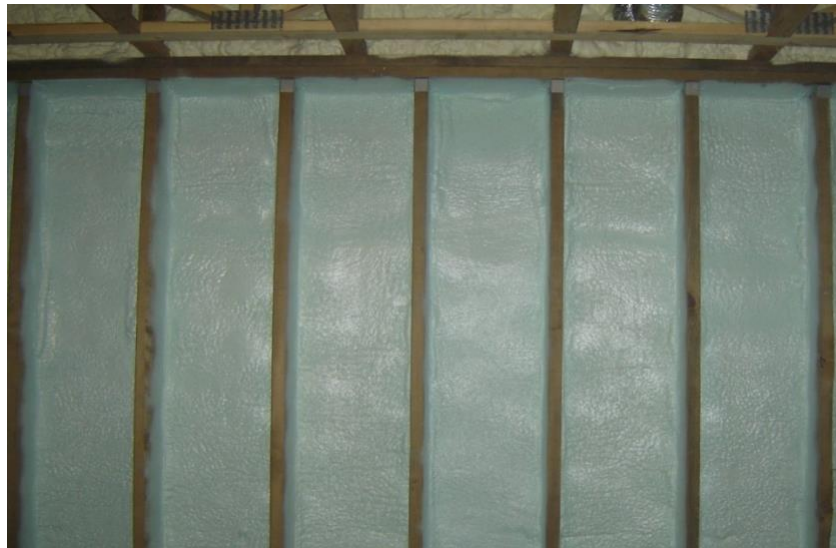
Figure 6 - SPF Behind Basement Wall Framing

The bottom plate of the framing should be pressure treated wood or installed on top of a water-resistant spacer that will hold the untreated wood above any bulk water drainage and prevent capillary transfer from the ground to the framing material.