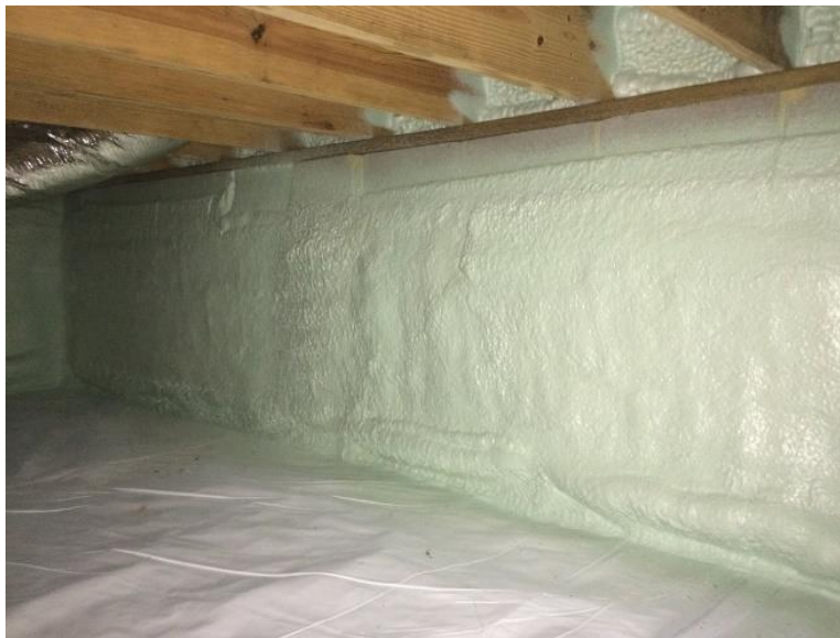
Figure 2 - Example of a Termite Inspection Gap in a Crawlspace Wall

Subterranean termites typically have large colonies below the ground and enter the building to feed on the wood framing. Termites travel from underground colonies to the food source by constructing tell-tale mud tubes along the foundation walls. Pest management professionals typically perform annual inspections looking for these mud tubes as well as the initiation of visible termite damage at the sill plate and band joists. In areas of high termite infestation probability, it may be necessary to leave an inspection gap in the foam at the top of the foundation to facilitate termite inspection. An example of an inspection gap is shown in Figure 2.