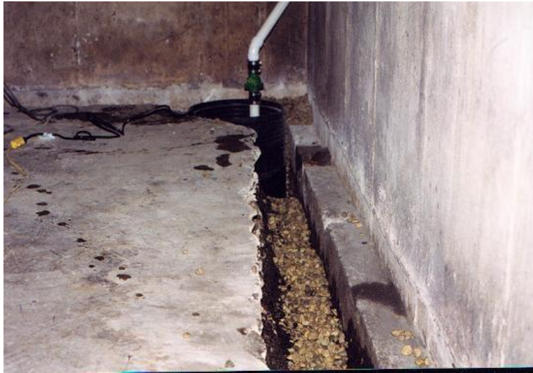
Figure 1 – Interior Foundation Drainage System with Sump Pump

foundation drainage system may not be feasible, especially in retrofit work. Instead, a perimeter drainage system along the interior side of the foundation walls may be installed. An example of an interior perimeter foundation drainage system with a sump pump is shown in Figure 1.