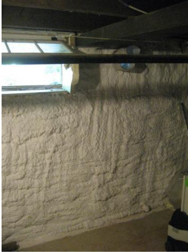
Figure 4 - Fully-Adhered SPF to Dry Masonry/Concrete Basement Wall (photo)